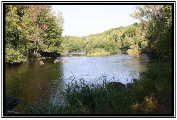
The Wolf River in Langlade County

In beginning to relate what the eastern part of Langlade County was like at the start of the logging and driving of saw logs down Wolf river, we must picture in our minds the vast tract of land covered with solid virgin timber from upper Pine Lake, extending south following the Wolf River valley to Shawano, and east