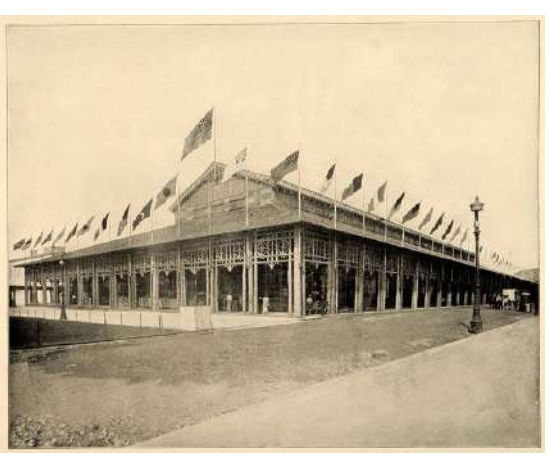
Forestry Building, Chicago's World Fair, 1893

The forest resources of the world are exhibited in the Forestry Building, which is one of the most interesting and unique structures on the arounds. It is made of wood and has a colonnade composed of tree trunks sent from almost every state in the Union. For instance: Arkansas furnished pine, white oak, red oak and sassafras; California, sugar pine, redwood and trunks of the hicory, huckleberry, sycamore and walnut; Delaware, red cedar