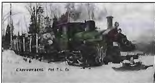
Tigerton Lumber Company's Steam Hauler, circa, 1915.