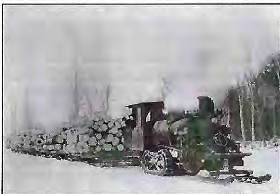
Steam log hauler made by Phoenix Manufacturing Company of Eau Claire, pulling loaded skids through snow. Rice Lake lumber camp, overland spur, ca. 1914.