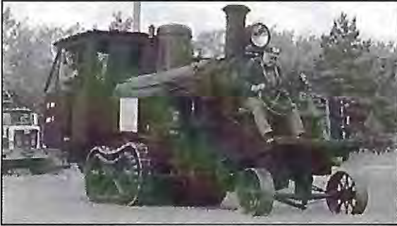
Steam log hauler made by Phoenix Manufacturing Company of Eau Claire, last known operational Phoenix in the state..

Wabeno, Wisconsin boasts a Logging Museum containing relics and records preserved in a replica of an old logging camp, presenting a nostalgic picture of the most colorful era in Forest County history. The Wabeno Lions Club built the Logging Museum in 1941. The museum is housed in a genuine notched log structure, created to replicate a logging camp. There are many items of interest in this museum, containing almost everything needed for