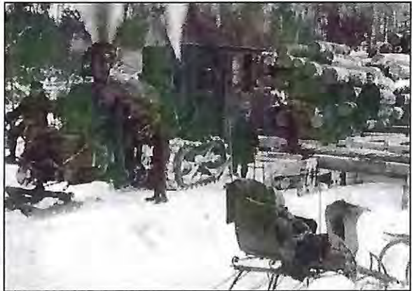
Steam Hauler and log sleigh, along side ice rutter and foreman's sled, 1918.