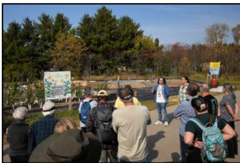
Sustainable Development Institute staff explaining the phenology trail and the demonstration forest garden site.

management is to provide for maximum diversity in the forest, habitat diversity, and to optimize growth and saw log quality of the forest timber resource.