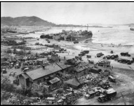
15 September 1950. American forces land in Incheon harbor one day after Battle of Incheon began.

In June 1950, North Korea invaded South Korea and Frank Roberta was among those immediately called to stem the communist advance. Following the Incheon Landing, U.N. forces drove deep into North Korea. When they continued northward, crossing the Yalu River, 300,000 Chinese troops counterattacked. Overwhelmed, the U.N. forces began a retreat to the south. The Chinese overran them and captured the area, shooting many wounded G.I.s and taking others prisoner. A few months later, Roberta was reported Missing in Action.