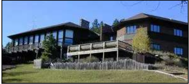
Treehaven Information—Information Technology UWSP

The 2026 Forest History Association of Wisconsin Conference at Treehaven begins early on September 25 with a hearty 7:30 a.m. breakfast, where attendees will also pack their box lunches for the day's field tour.